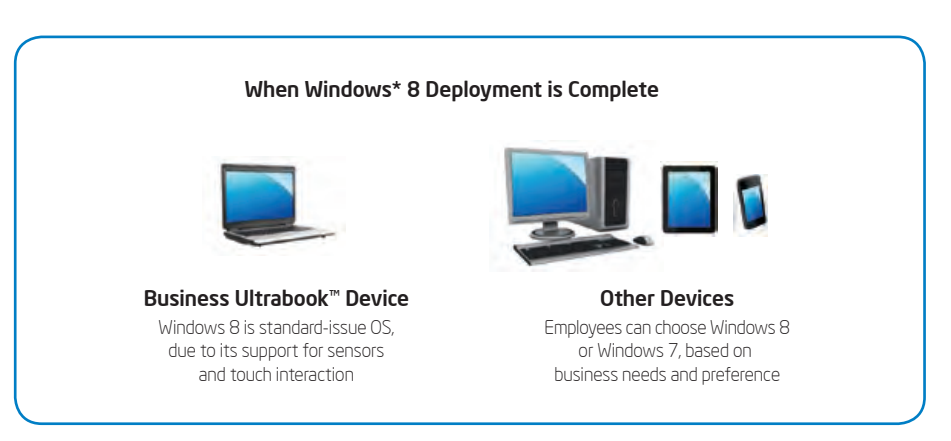
Figure 2, Windows* 8 will become the standard-issue OS for business Ultrabook™ devices and will be an option for other devices as well.